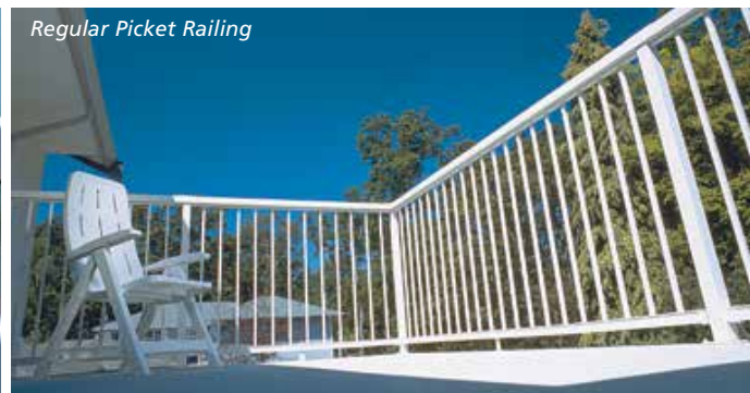
Regular Picket Railing