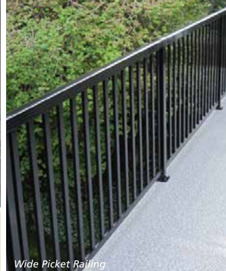
Wide Picket Railing