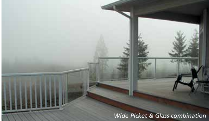
Wide Picket & Glass combination