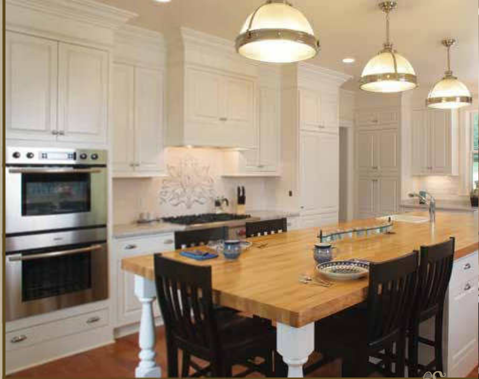
Independence Doors, Slab Drawers, Inset Frosty White on Maple

The impressive kitchen pictured below uses a dark Toffee finish to extend dramatic depth and opulence to the many charming Tuscan details.