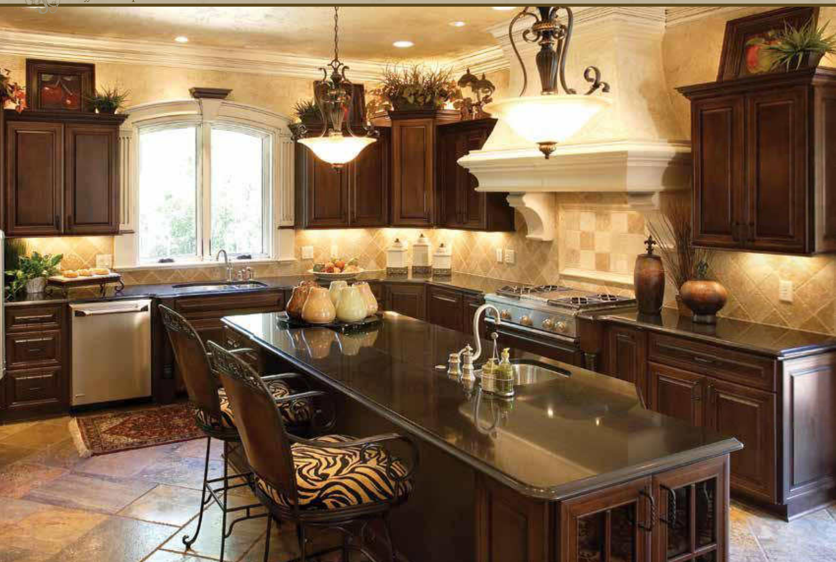
Venice Doors, Venice Drawers, Full Overlay Toffee on Maple