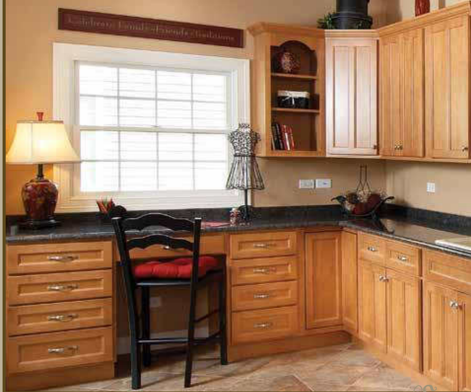
Lancaster Doors, 5PC-Flat Drawers, Standard Overlay Spiced Rum on Maple

With an endless array of options, any room can become an impressive area while maintaining its practical purpose. Just identify your individual needs and have a space created with Great Northern Cabinetry that fulfills all your wishes.