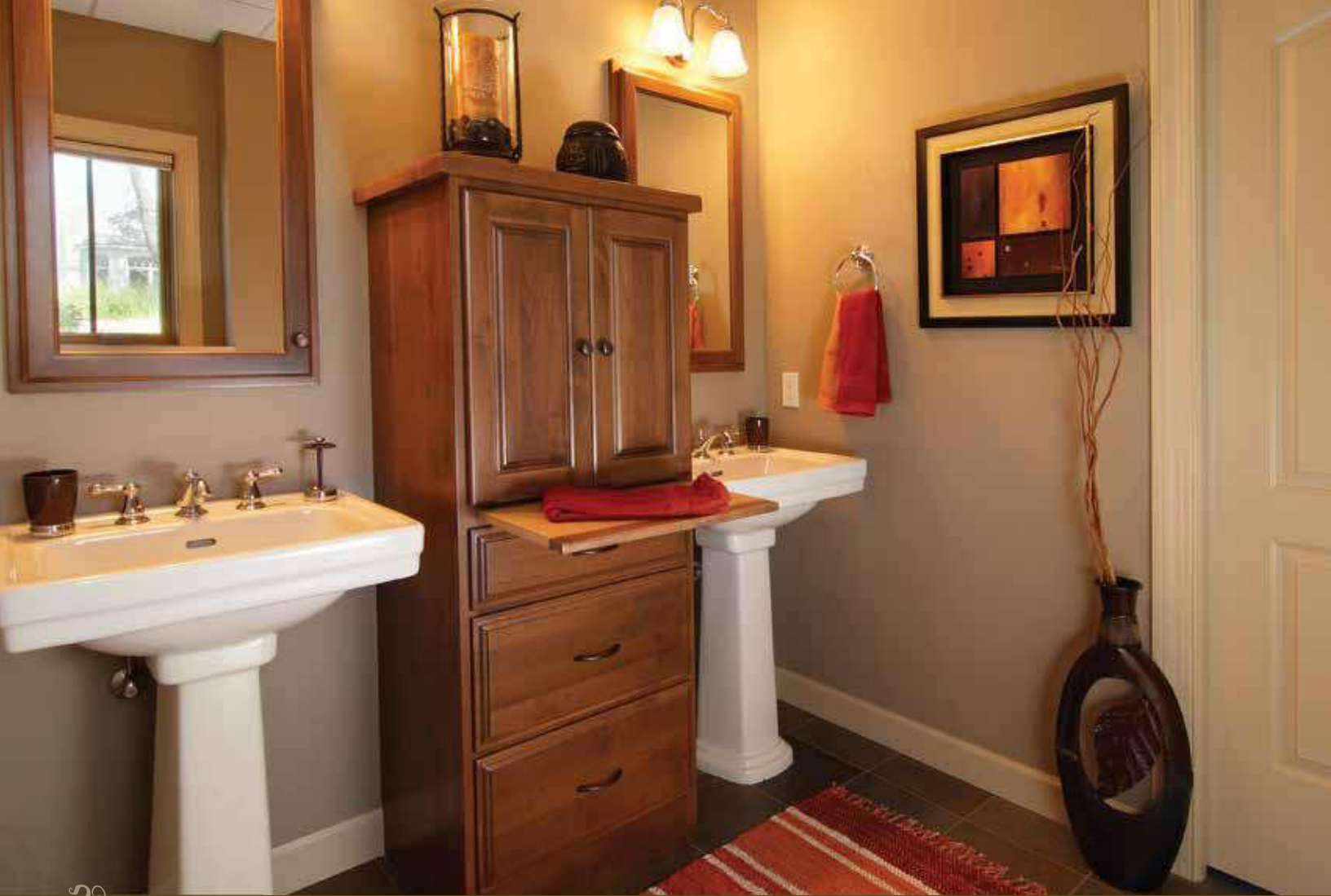
Independence Doors, Slab-C Drawers, Standard Overlay Heirloom on Alder