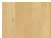
NATURAL BIRCH 222-2115