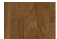
NATURAL WALNUT 222-2125