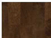
MOCHA BIRCH 222-2100

*5-10% of carton content is comprised of random length boards 12", 24" and 36"